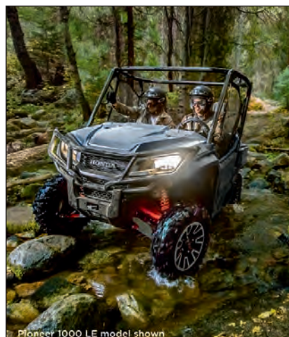
Pioneer 1000 LE model shown